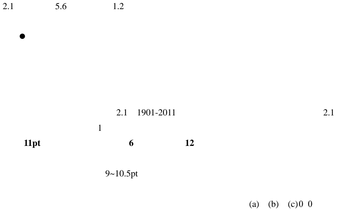
Fig 2.1 Distribution of annual mean temperature Northwest